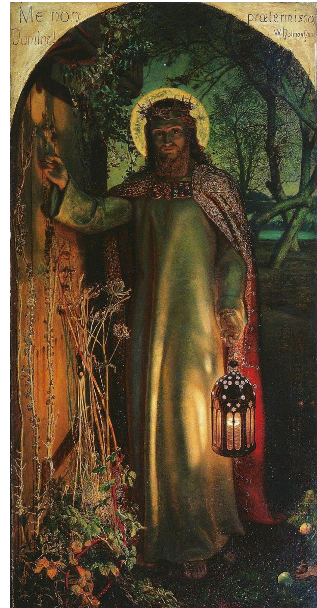
William Holman Hunt, The Light of the World , 1854

“When you begin your work, you must be in a state of active vigilance.” - G.I. Gurdjieff, Excerpts from a Meeting , 1943