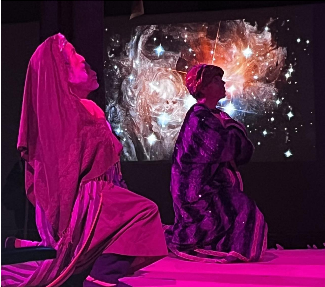
The Glorious Impossible Sacred Community Theatre