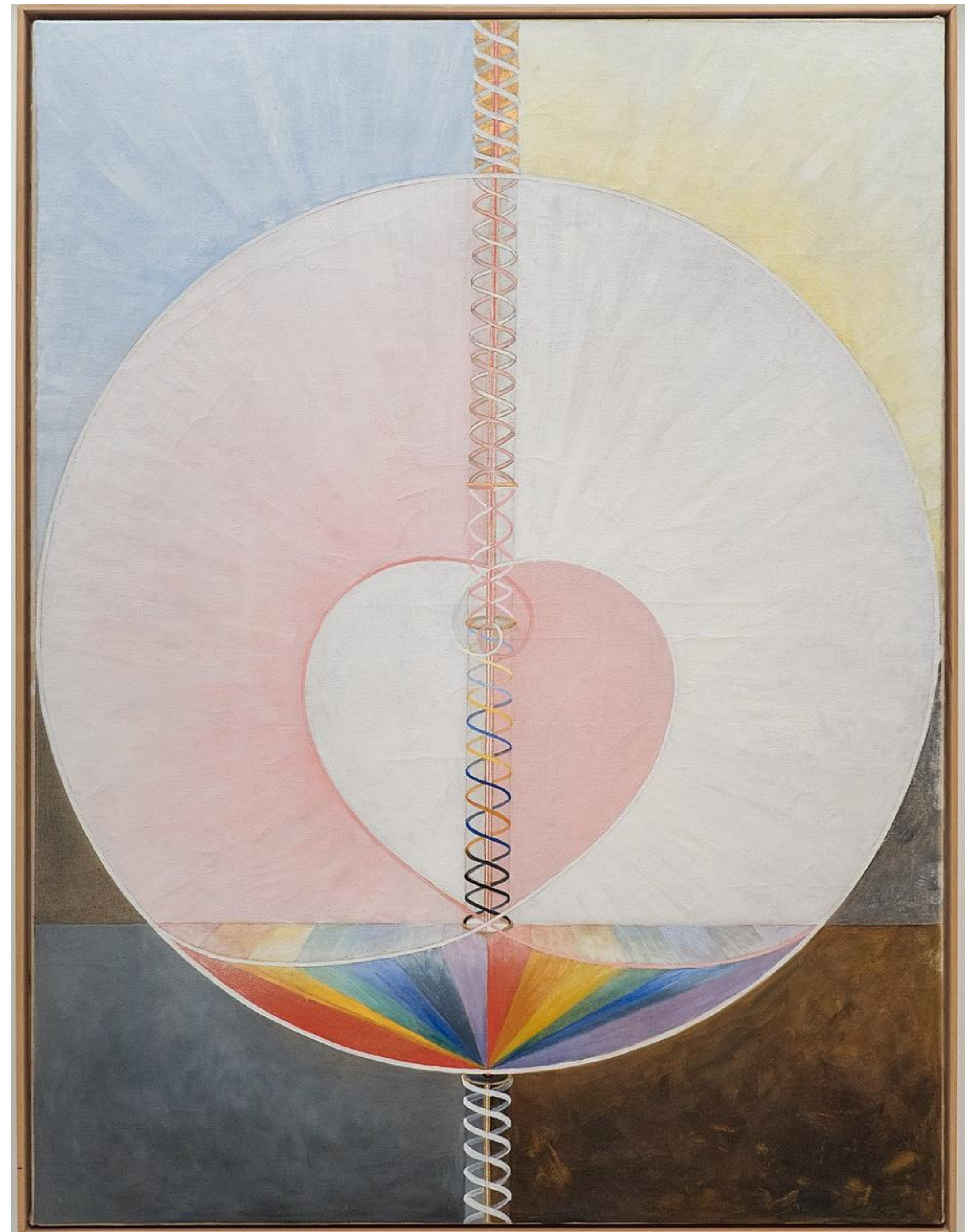
Willem de Kooning