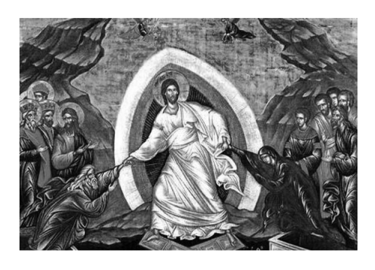
I came so that you may have life.