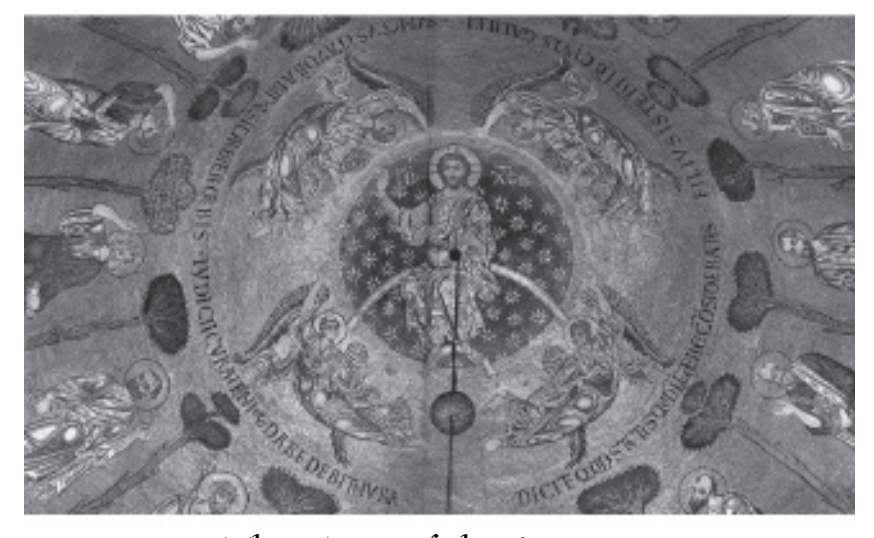
The Grace of the Ascension

The cosmic Christ, revealed in the mystery of the Ascension, manifests our deep self and the inner nature of all reality. What is manifested is the living, vibrant Spirit, filling us and all things with boundless life and love. The Spirit is always present, yet always coming to us. That is because the divine actuality becomes present in a new way each time we move to a new level of spiritual awareness. The Spirit has been given; yet He is always waiting to be received so that He can give Himself again – and more completely.